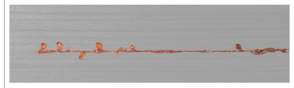
Fig. 2 Pitch or resin on painted surfaces can be easily removed using a clean rag and mineral spirits or turpentine.

Pitch or resin bleeding is not considered a defect in wood . . .